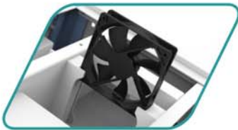
Removable axial DC-Fan