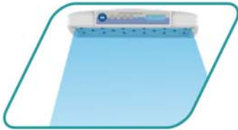
BL-30D Upside phototherapy unit