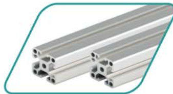
Alumminum alloy material