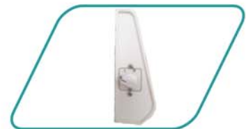
Two level adjustable of humidity