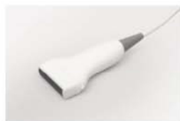
7.5MHz Linear Probe

Application : Superficial tissue, Small parts, Blood vessel