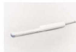
6.5MHz Transvaginal Probe