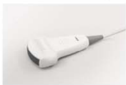
3.5MHz Convex Probe