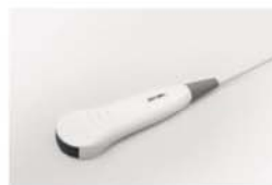
5.0MHz Micro-convex Probe

Application : Superficial tissue, Small parts, Blood vessel